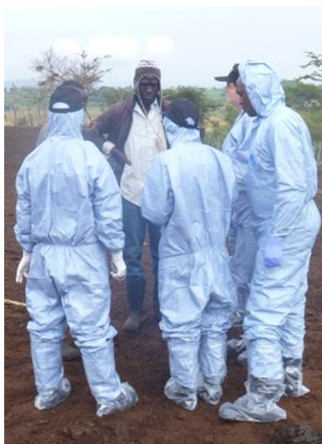
Outbreak investigation during field visit during NTC25

The courses are getting positive feedback and we welcome suggestions for even more improvements.