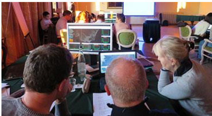
Trainees working with the Australian model AAIDS

During the week, the trainees worked in teams on four different scenarios to enable them to decide on which is the best strategy to control a hypothetical FMD outbreak. The teams based their reports on the outputs obtained using the Australian model AAIDS and on the results of applying participatory multi-criteria analysis.